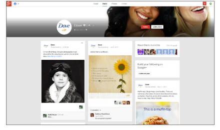
Left to right: Dove's Google+ hangout for Mothers' Day; Dove's Google+ page