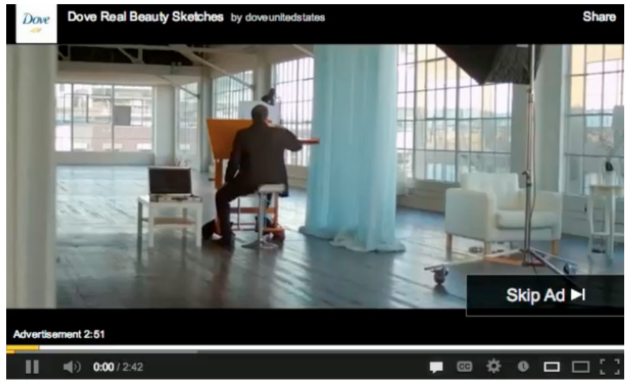
TrueView ads for Dove Real Beauty Sketches helped to ignite global viewership of the video

Dove believes in celebrating beauty in its diversity and in doing so, raising the self-esteem of women and young girls globally. Featuring real women in advertising has been an integral part of the Dove brand's DNA—dating back to the introduction of the Dove Beauty Bar in 1957.