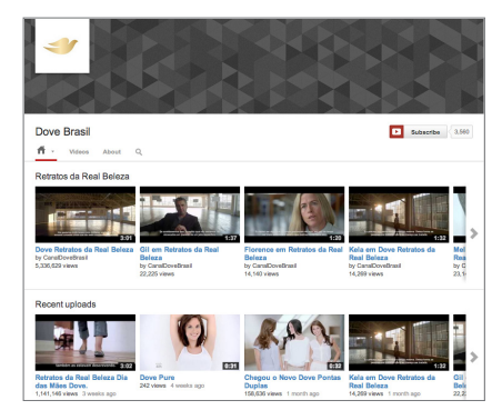
Left to right: Dove's YouTube brand channel in the US; Dove's brand channel in Brazil