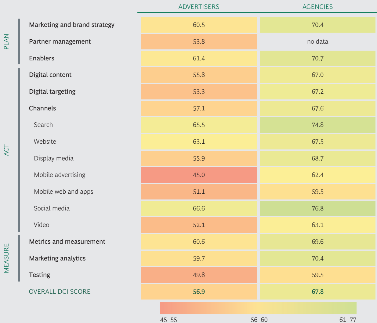
EXHIBIT 2 | Advertisers and Agencies: Specific Digital Capabilities