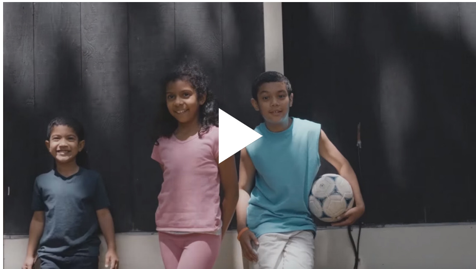
The Gomez Family (2:17)