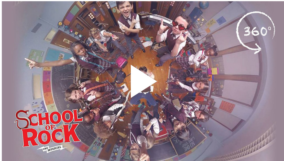
SCHOOL OF ROCK: The Musical – "You're in the Band" (360 Video)

Virtual reality takes the 360-degree video experience a step further by adding depth. When viewed with a VR headset—not far from those red View-Masters you might have used as a kid—images become three-dimensional, which adds to the feeling of immersiveness. On top of that, spatial audio lets people listen to audio from all directions, just as in the real world.