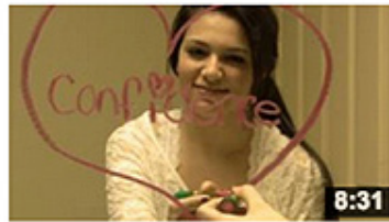
Confidence. 564,818 views 3 years ago