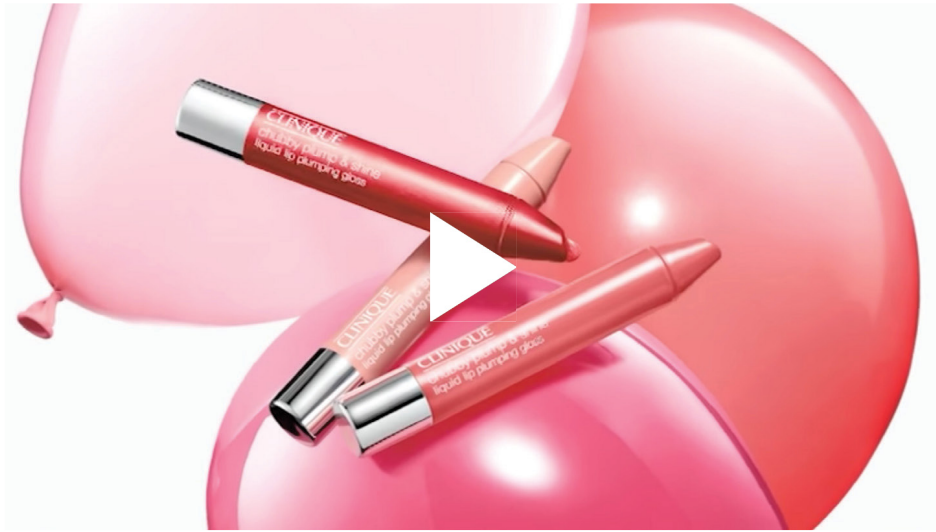
Balloon clinique bumper 2 4

The second version, "Tribe", featured an ad with the four different Chubby Stick formulas that faded into the brand logo.