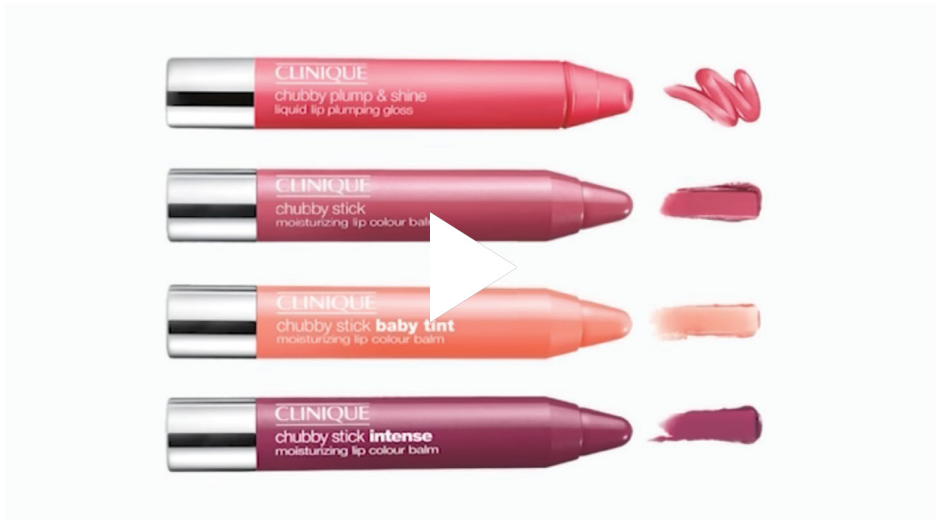
Tribe clinique bumper 1 4

The final version, "Lips", featured the Chubby Plump & Shine product alone, imposed on a digitised background. Of the three bumper ads, this one was least reflective of its original print creative.